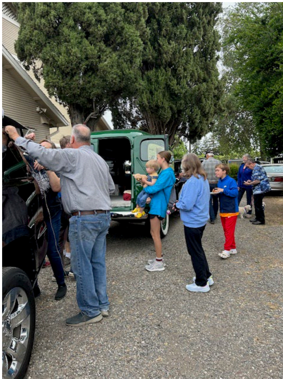
GATHERING FOR THE DRIVER'S AND NAVIGATOR'S MEETING