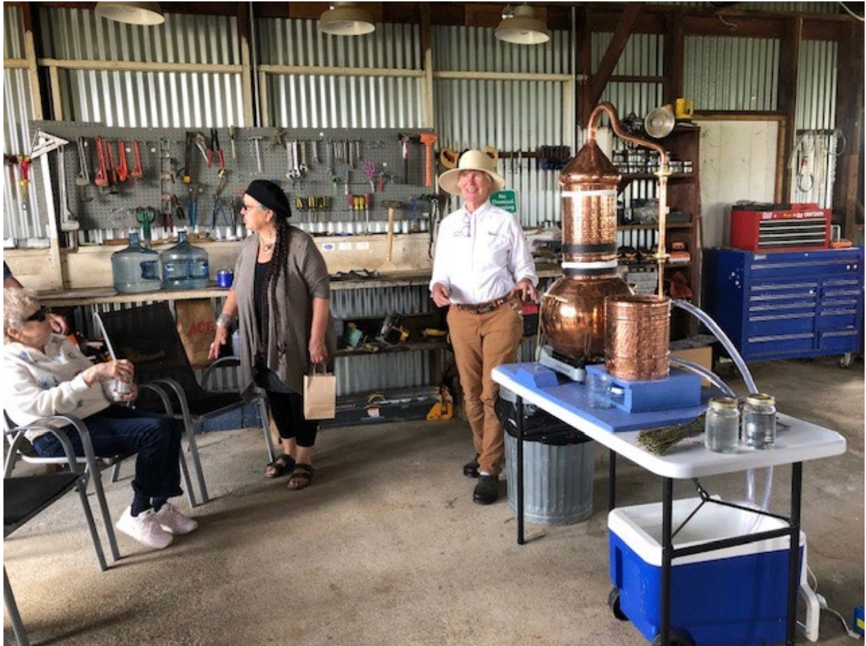
AT THE DISTILLERY

The product produced has many commercial uses, but the most surprising one was to make lavender flavored ice cream, which is sold on the premises and sampled by many in our group!