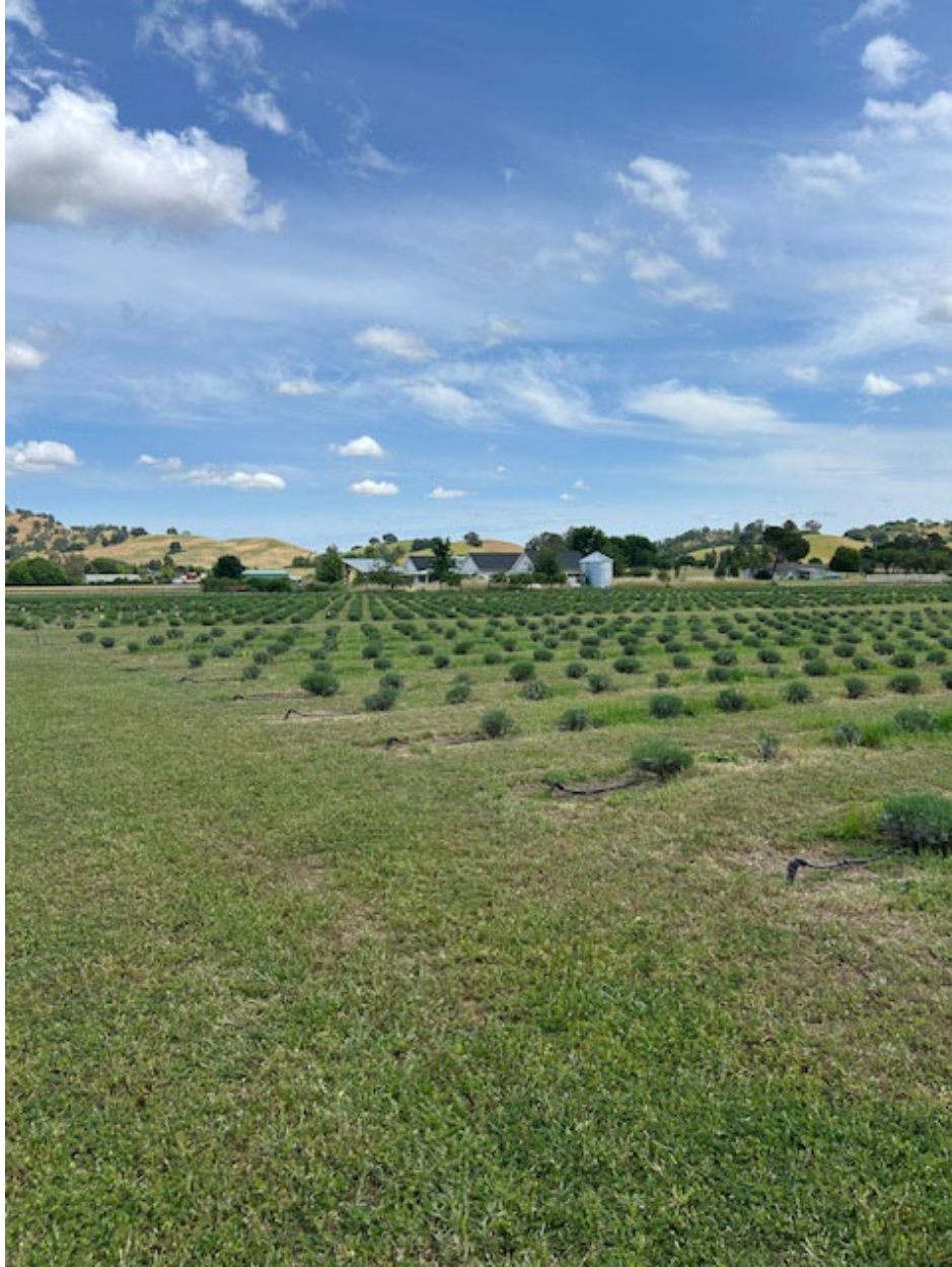
LAVENDER FARM WIDE ANGLE VIEW